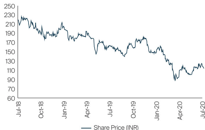
Share Price of the FMCG Company

2019 Conclusion – “It is a shame that a good business will be destroyed because the family is adamant to maintain its control, just so that each of them has something to do. A shocker of a meeting with the next CEO.”