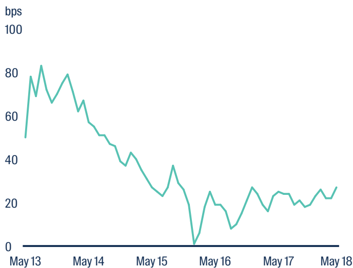
Figure 2: Asia IG spreads over US IG

In comparison, the Asian Investment Grade sub-sector has remained reasonably resilient and we continue to promote this lower volatility option to investors. Asian Investment Grade spreads narrowed to post-2008 tightness in January 2017, but have tracked US Investment Grade spreads wider since, highlighted in Figure 2 below.