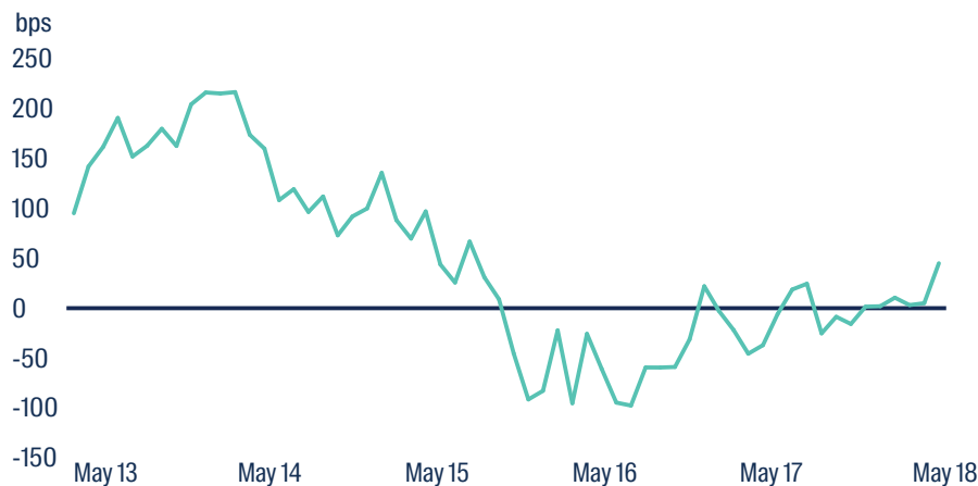
Figure 1: Asia HY spreads over US HY

Historically, Asian Investment Grade and High Yield credit spreads have traded at a premium relative to US issuers. Towards the end of 2015, however, demand for Asian High Yield exploded, resulting in spread narrowing. In fact, for most of the following two years, Asian High Yield spreads were narrower than High Yield spreads in the US. Brief periods where Asian High Yield spreads widened during this period saw buyers emerge in force, capping any widening. As shown in Figure 1, this demand meant Asian High Yield spreads traded in line with US High Yield spreads at the end of 2017.