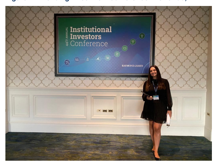
Figure 2: Attending investment conference in Orlando, FL.

Andrew: like Sophie's mortgage rate, utility allowed ROEs are likely to increase in 2023