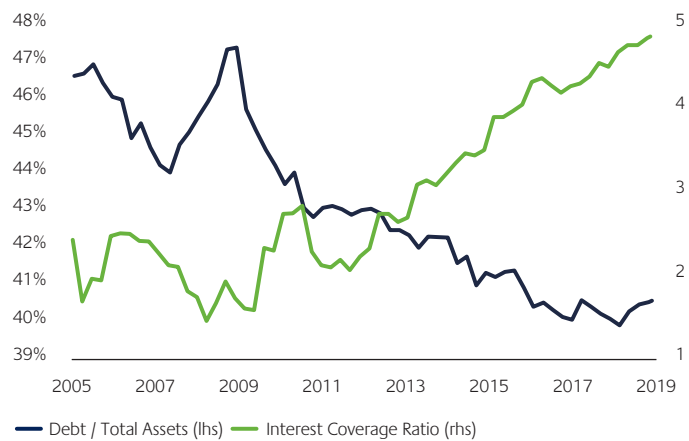
Sector refers to the FTSE EPRA/NAREIT Developed Index. Chart reflects a quarterly time series except for the most recent data point. Interest Coverage Ratio refers to EBITDA / Interest Expense.