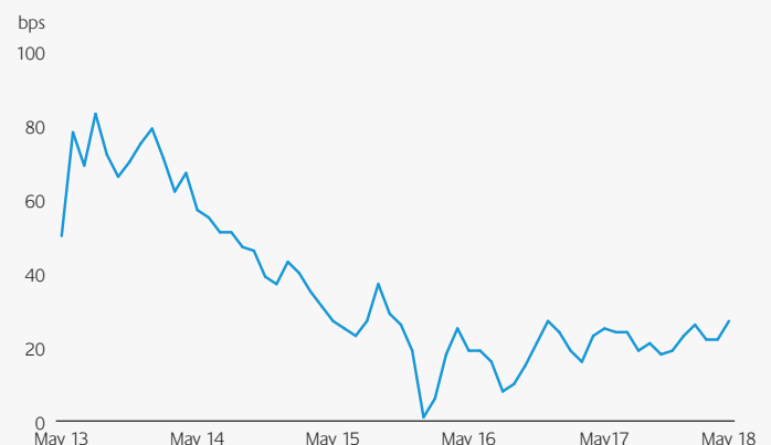
Figure 2: Asia IG spreads over US IG

Data as at 31 May 2018.