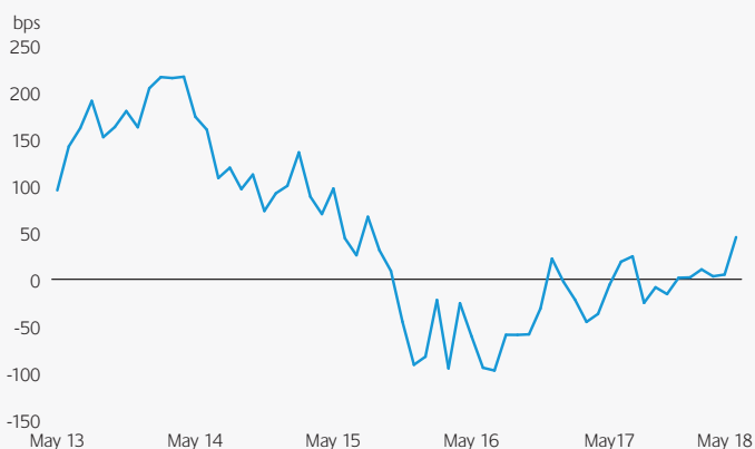
Figure 1: Asia HY spreads over US HY

Source: BBG and Barclays Index. Data as at 31 May 2018.